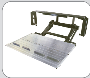
TL Series Level Ride Fold-Away™ Liftgates