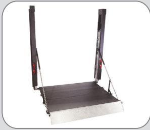
DH Series Direct Hydraulic Twin Column Liftgates